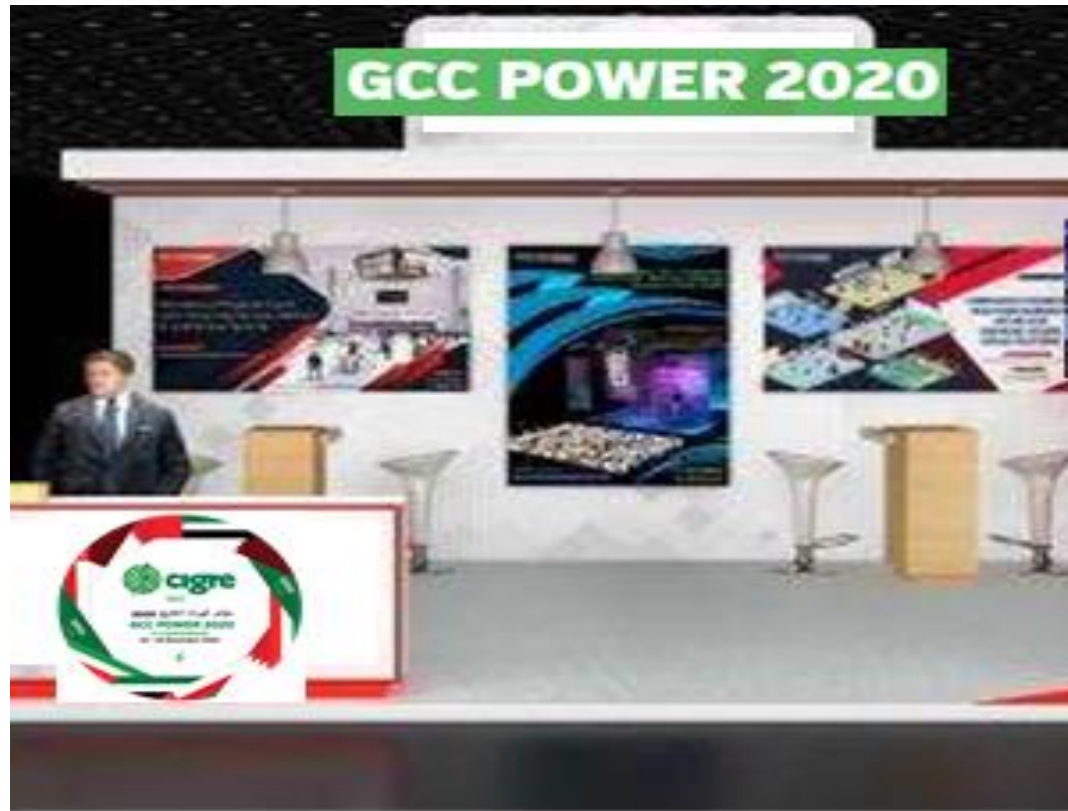
Exhibit Partner USD 2000