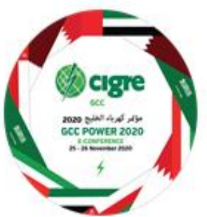
Key Partner Logo's